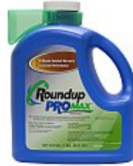
Roundup Pro Max