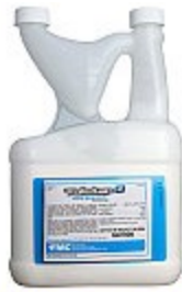
Talstar P (Talstar One) - 3/4 Gallon