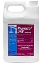
Pramitol 25E - Gallon

Thank you for choosing DoMyOwnPestControl.com!